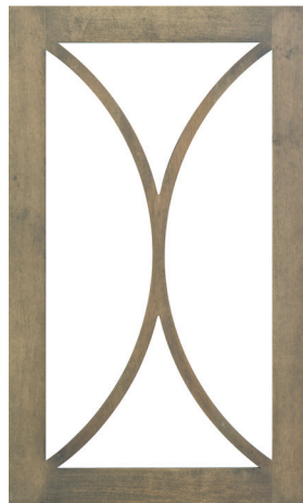
337WG SR-35, E-104 Minimum size: 18" X 18"