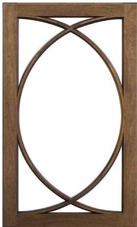
335WG SR-20G, E-106 Minimum size: 18" X 32"