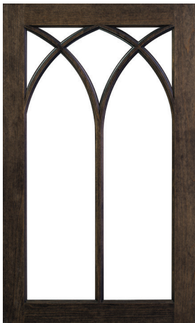
333WG SR-20G, E-104 Minimum size: 18" X 18"