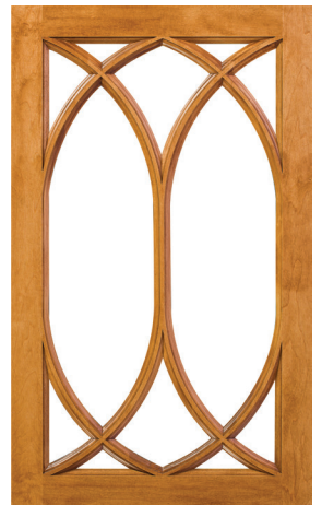
338WG SR-10G, E-104 Minimum size: 18" X 27"

Inside profiles available: SR-10G, SR-20G, SR-30G, SR-35G, and SR-80G