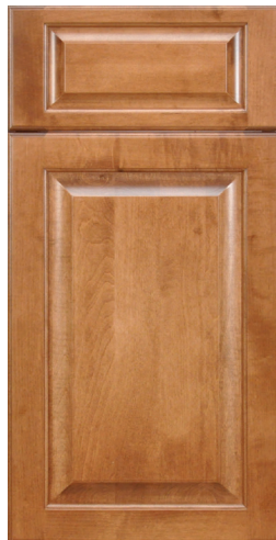
301 P201 – E106 – SR20 • Maple - Hard • Autumn Wheat