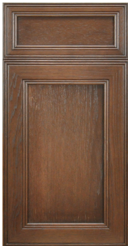
MR40FP(3) 1/4" – M302 – MR40 • Hickory • Dark Pecan