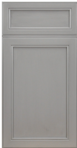
463 1/4" • Paint Grade • Cobblestone - Brushed Black Glaze