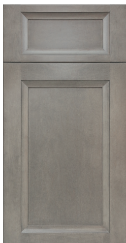
FM388FP(3) 1/4" - E123 - FM388 • Maple - Hard • Driftwood