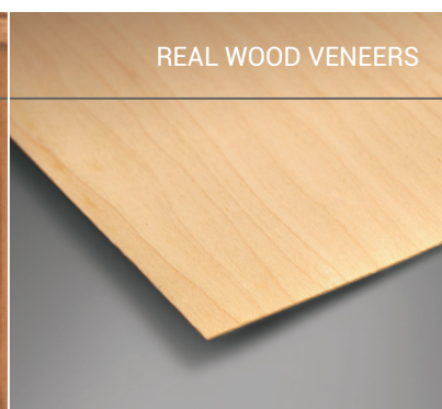
REAL WOOD VENEERS