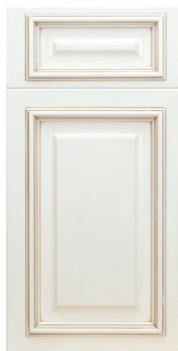
601AM E123 - SRP211 Deep - V100 • HDF • Snow White Brn Glaze