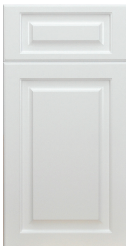
601 E106 - SRP211 • HDF • Snow White