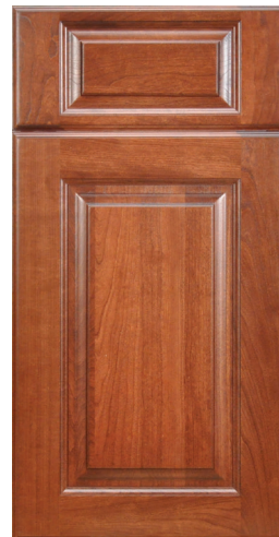
301(3) P209 – E110 – SR10 • Cherry • Brandy