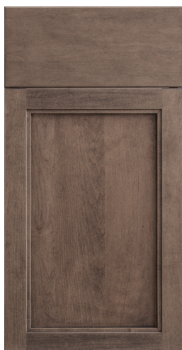
FM387RP(2-1/4) P204 - E131 - FM387 • Maple - Hard • Lava Stone

Superior Craftsmanship. Remarkable Service.