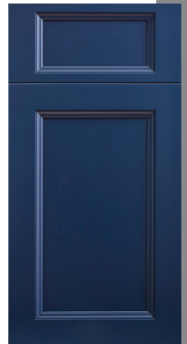
401(3) 1/4" – E123 – SR77 • Paint Grade • Nightfall